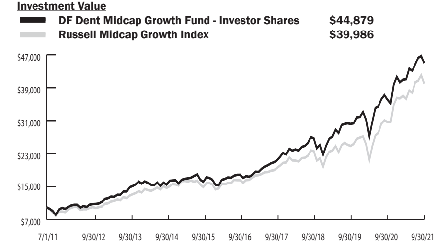
Past performance is not reflective of future performance. Performance shown in the Growth of $10,000 chart represents a hypothetical investment initiated at the beginning of the time period shown. The total return of the Fund includes operating expenses that reduce returns, while the Index returns do not include expenses.